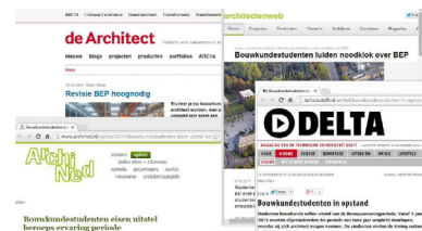
Our press release about the architects' title