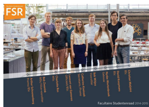
The Faculty Student Council